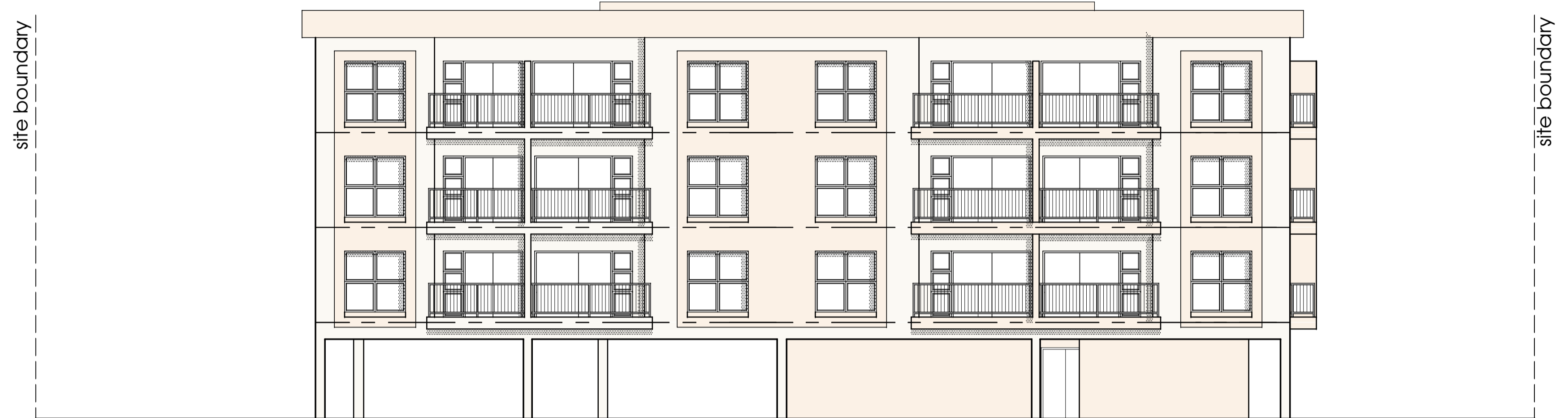
NORTH - EAST ELEVATION SCALE 1:100