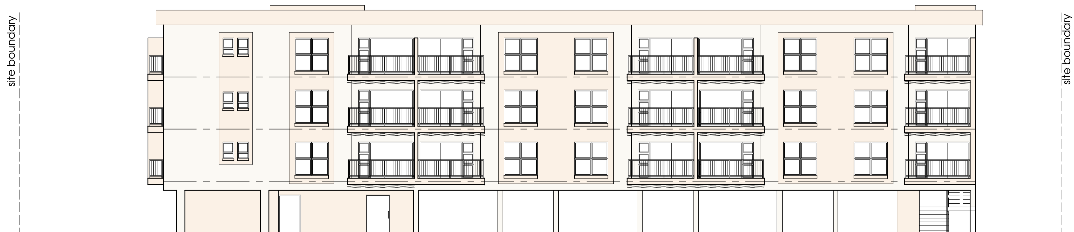
NORTH - WEST ELEVATION SCALE 1:100